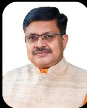
Shri Prithviraj Harichandan

(Hon'ble Cabinet Minister of Law , odisha)