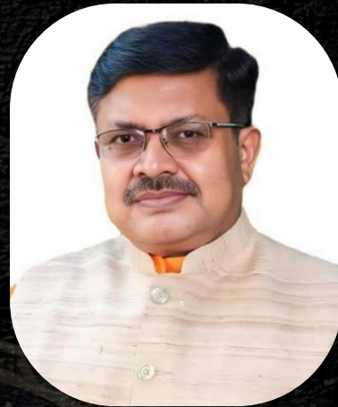
Shri Prithviraj Harichandan (Hon'ble Cabinet Minister of Law , odisha)