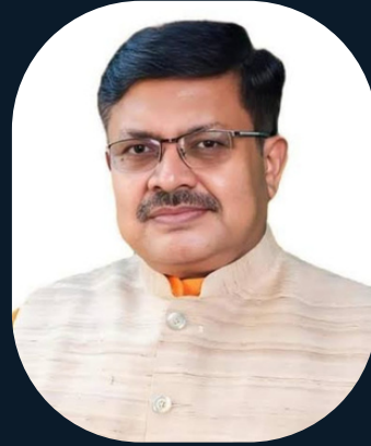
Shri Prithviraj Harichandan

(Hon'ble Cabinet Minister of Law , odisha)